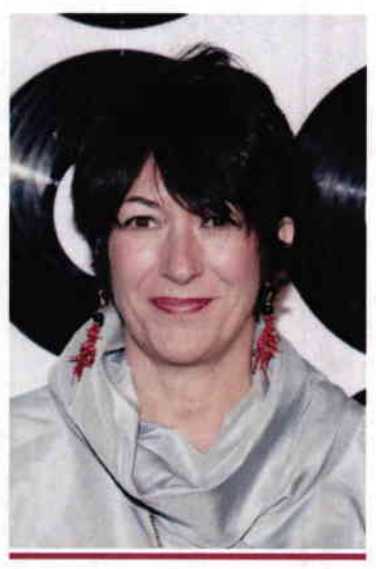
Ghislaine Maxwell

Mary claimed she had been driven to the mansion on El Brillo Way, where a female staffer escorted her up a pink-carpeted staircase, then into a room with a massage table, an armoire topped with sex toys and a photo of a little girl pulling her underwear off.