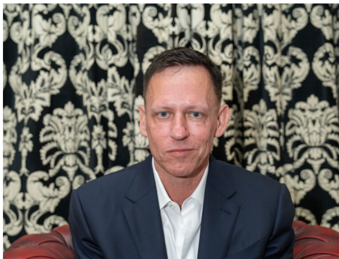
Pictured: Peter Thiel.

According to reports, past gatherings were held in Arizona and Venice, while future plans include a campus in the Washington area.