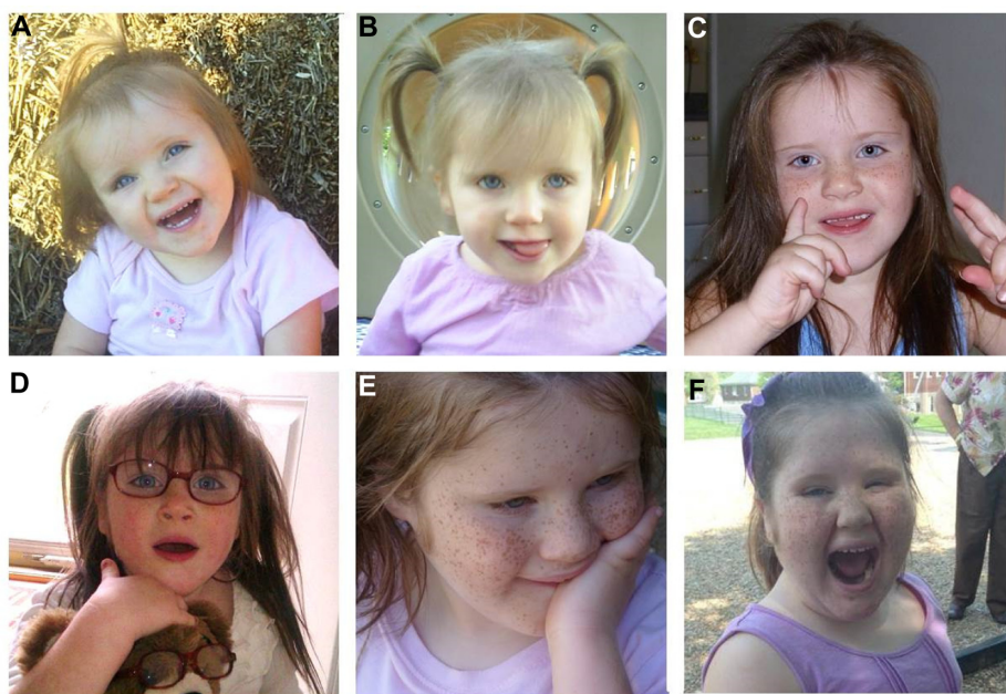
Figure 1 Facial features of a girl with a terminal 1p36 deletion (chr1:1–3,047,838; GRCh37/hg19).

In this article, we review recent successes in the effort to map and identify the genes and genomic regions that contribute to specific 1p36-related phenotypes. In particular, we highlight evidence implicating haploinsufficiency of MMP23B , GABRD , SKI , PRDM16 , KCNAB2 , RERE , UBE4B , CASZ1 , PDPN , SPEN , ECE1 , HSPG2 , and LUZP1 in the development of various 1p36 deletion phenotypes. All of the coordinates referenced in the text and figures are based on human genome build GRCh37/hg19.