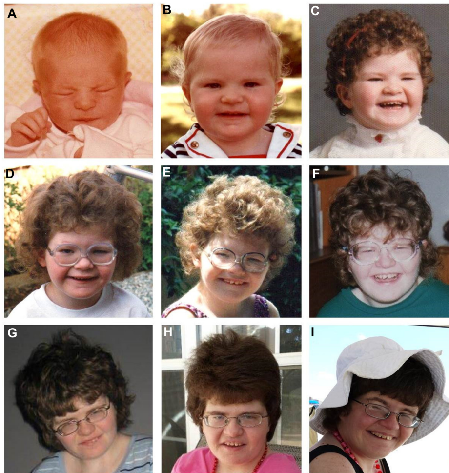
Figure 2 Facial features of a woman with a large interstitial 1p36 deletion (chr1:3,313,081–12,530,129; GRCh37/hg19).

Notes: Photos were taken at (A) birth, (B) 16 months, (C) 5 years, (D) 7 years, (E) 9 years, (F) 14 years, (G) 25 years, (H) 31 years, and (I) 32 years of age. Her deletion partially overlaps the distal critical region and includes the entire proximal critical region of chromosome 1p36. Characteristic facial features that are evident in these photos include straight eyebrows, deeply set eyes and epicanthal folds. Other features that are not readily apparent in these photos include brachycephaly, small, low set ears, and facial hirsutism.