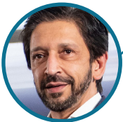
NUNES Ricardo Mayor of Sao Paulo