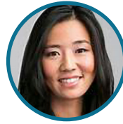
WU Michelle Mayor of Boston