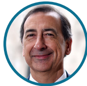
SALA Giuseppe Mayor of Milano