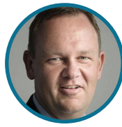
FROST RASMUSSEN Jesper Mayor of Esbjerg, Denmark