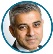
KHAN Sadiq Mayor of London