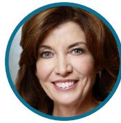
HOCHUL Kathy Governor, New York State