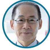
LEE Hoesung IPCC Chair – 2023