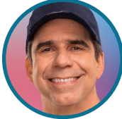
CHAR CHALJUB Alejandro Mayor of Barranquilla, Columbia