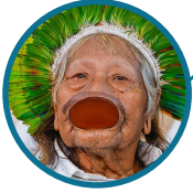
METUKTIRE Raoni Kayapó people, Brazilian Amazonia