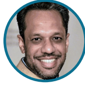
GHOSH Arunabha Founder-CEO, Council on Energy, Environment and Water, India