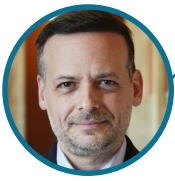
DOUKAS Haris Mayor of Athens