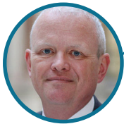
TROTT Christopher Ambassador of the United Kingdom to the Holy See