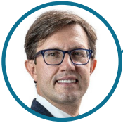
NARDELLA Dario Mayor of Florence