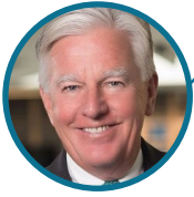
MEEHAN Martin T. President of the University of Massachusetts