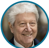
CARAMASCHI Renzo Mayor of Bolzano