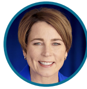
HEALEY Maura Governor, Commonwealth of Massachusetts