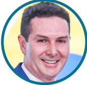
BARBALHO FILHO Jäder Minister of Cities