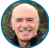
COGUT Craig Pegasus Capital Advisors LP