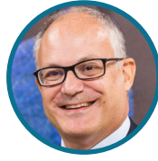
GUALTIERI Roberto Mayor of Rome