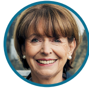
REKER Henriette Mayor of Cologne