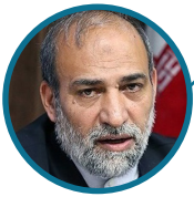
FOROUZANDEH DEHKORDI Lotfollah First Deputy, Mayor's Office of Tehran