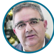
JALIL Raoul Governor of Catamarca