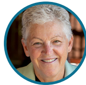
McCARTHY Gina Former White House Climate Advisor