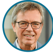
LELIEVELD Jos Max Planck Institute