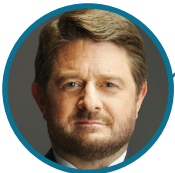
ORREGO Claudio Governor of Santiago Metropolitan Region