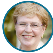
LUBCHENCO Jane PAS Academician