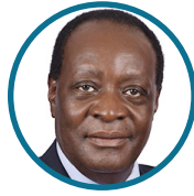
OTTICHILO Wilber Governor of Vihiga County, Kenya