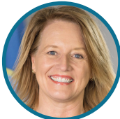
CRISWELL Deanne FEMA Administrator, USA