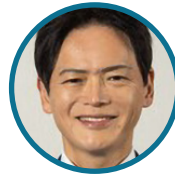
YAMANAKA Takeharu Mayor of Yokohama