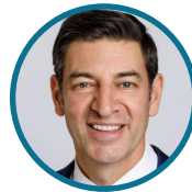
ZEMPILAS Basil Lord Mayor of Perth, Australia