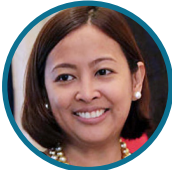
BINAY Abigail Mayor of Makati, Philippines