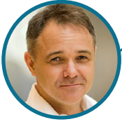
FARRAR Jeremy Chief Scientist, World Health Organization