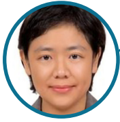
SHIH Wen-Chen Deputy Minister of the Ministry of Environment, Taiwan