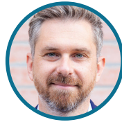
LEPORE Matteo Mayor of Bologna