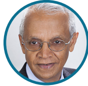
RAMANATHAN Veerabhadran PAS Academician