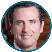
NEWSOM Gavin Governor of California