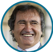
BRUGNARO Luigi Mayor of Venezia