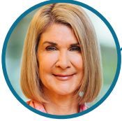
MOHN Brigitte Bertelsmann Stiftung